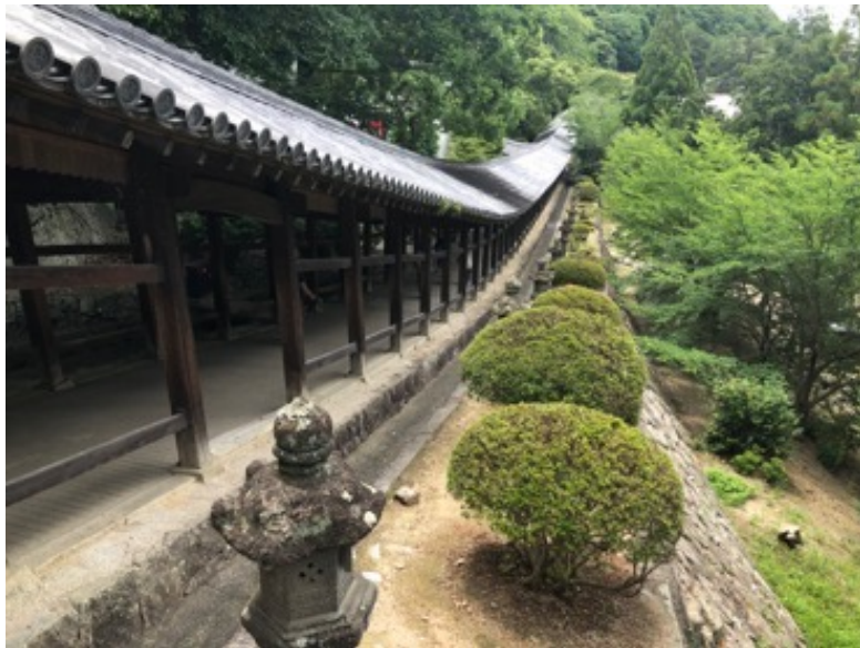
Kibitsu-jinja --- Okayama