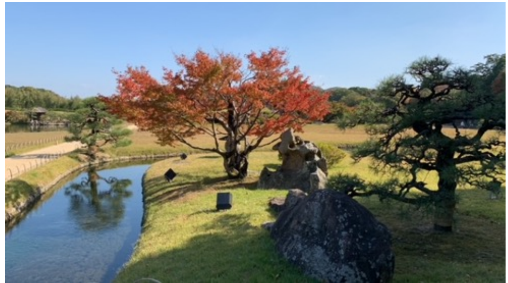
Okayama Garden (Kora-Kuen) -- Courtesy by Alain WAGNER - November - 2022